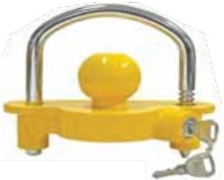
▪ Trailer Hitch Lock #REE 72783