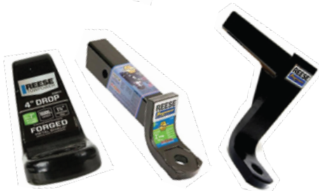
▪ *MORE SELECTION OF CLASS II BALL MOUNTS*