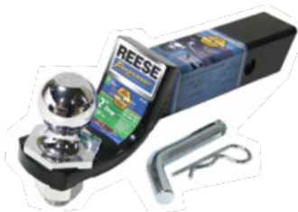
▪ 2" Drop Towing Starter Kit #REE 21536