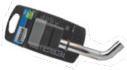
▪ Receiver Lock #REE 7006500