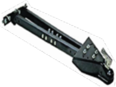
▪ Adjustable Tow Bar #REE 7014200